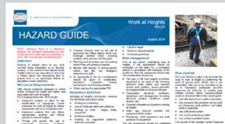
GHD Hazard Guides