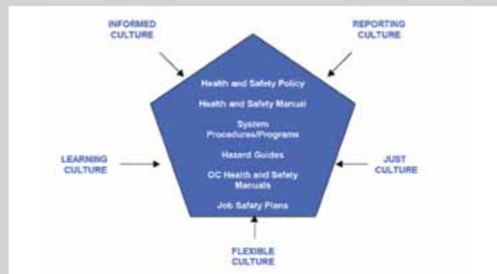
Safety Culture Connect